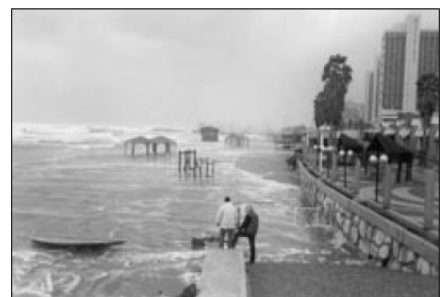
Flooding. Tel Aviv beach, 2004