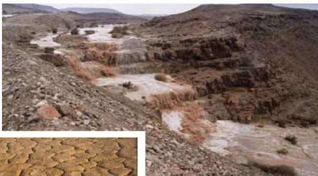
Flash flood in the Judean desert