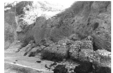
The collapse of the facade wall of the Apollonia barrow